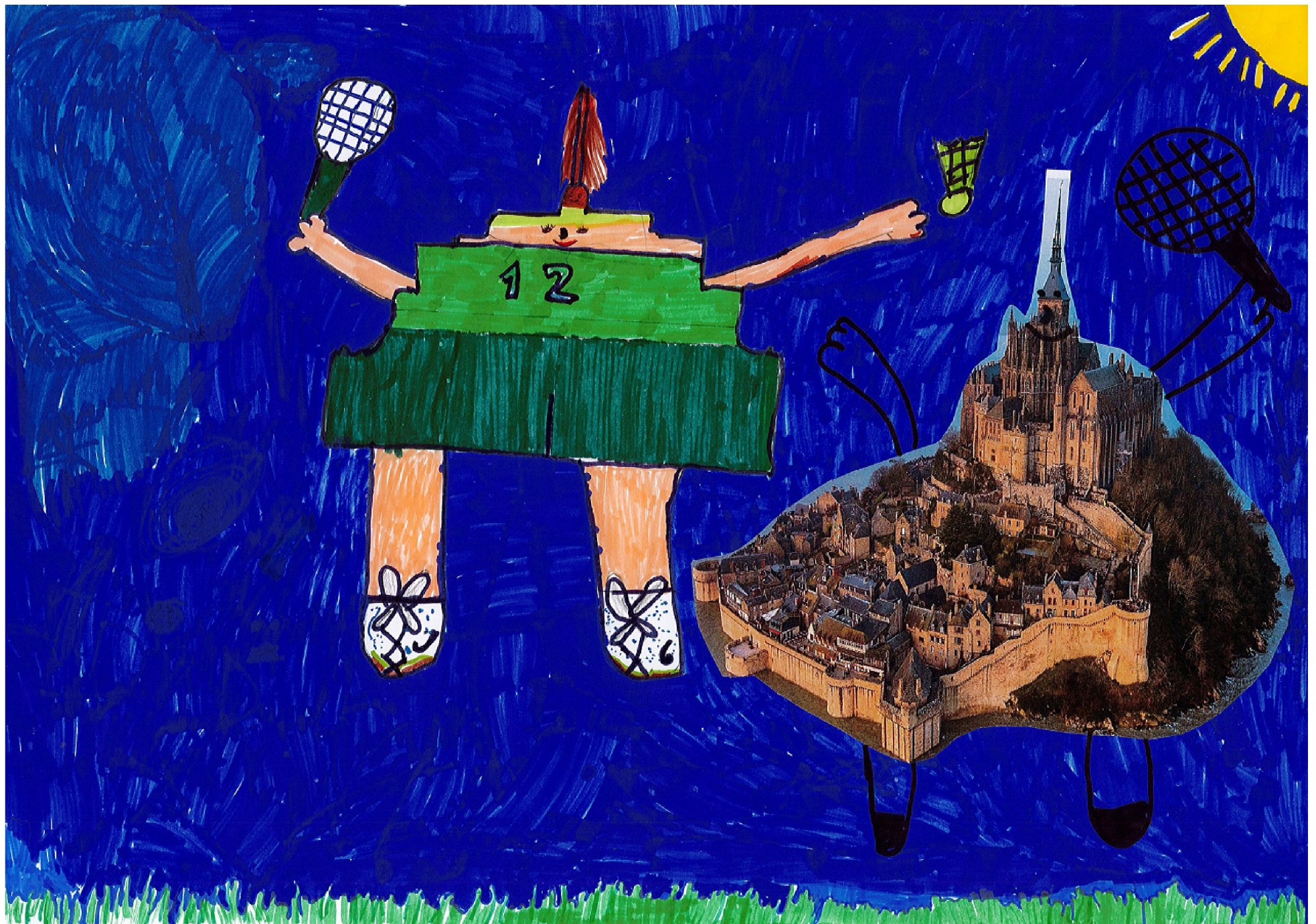
The Mont Saint Michel plays badminton!